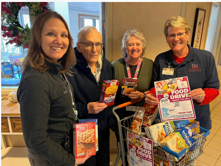
Thank you to everyone who donated food for our March food drive. All donations will go to the Little Free Pantry at Salem Lutheran Church and the Salvation Army in Albert Lea!