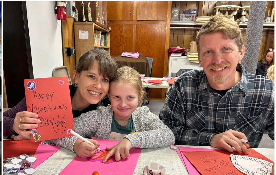
Thank you to one of St. John's sponsoring churches for spreading love and kindness in our community! Bear Lake Lutheran Church Sunday school students created beautiful Valentine's Day cards for our residents!